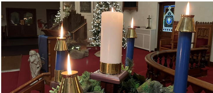
“Blue Christmas” - December 15, 2024 at 9:15am

Sponsored and Held at Zion Lutheran Church - 925 Fifth Avenue - Rockford, IL 61104